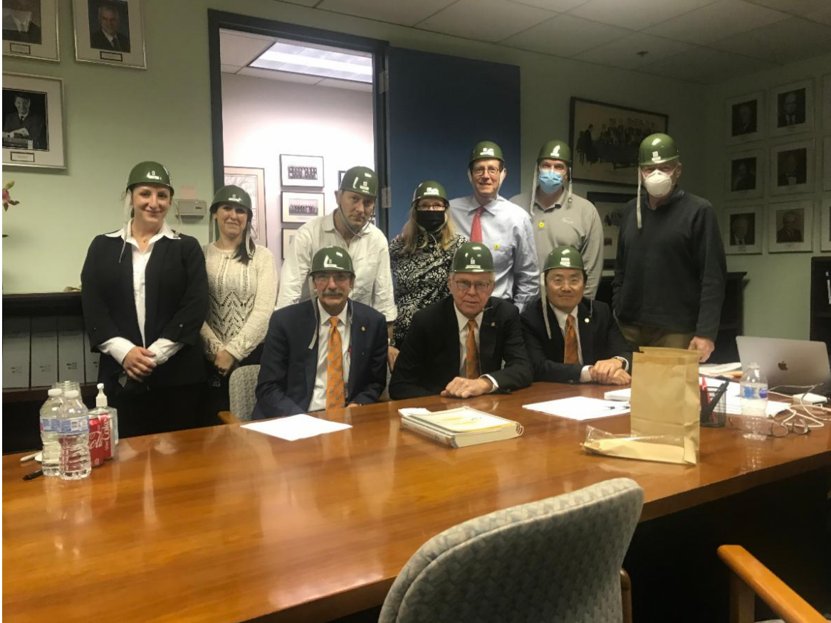
The Oral Exam Task Force supporting the November 2020 virtual exam from the Philadelphia Board Office